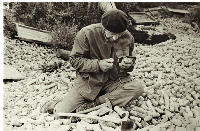
8. At the base of IMGRE: "Closer to the light!"