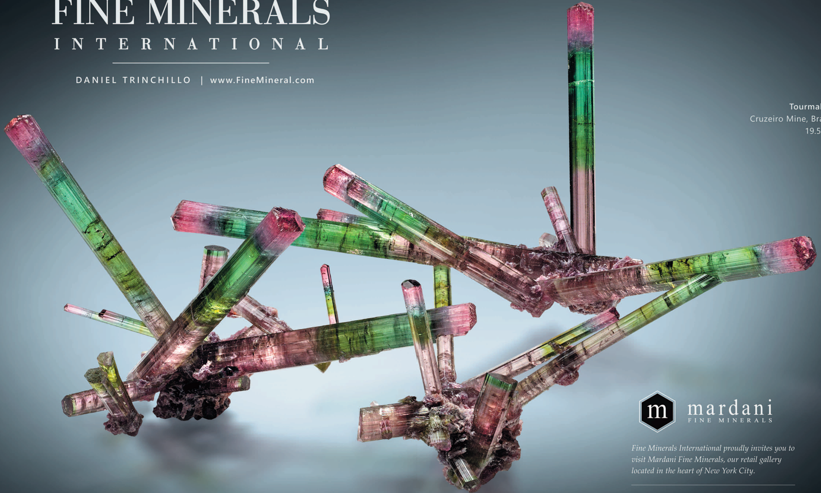
Tourmaline Cruzeiro Mine, Brazil. 19.5 cm