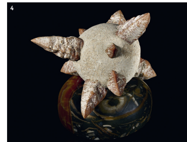
4. Calcite (glendonite aka "Belomorian spikes", pseudomorph after ikaite). 11 x 9 cm. Olenitsa, Kola Peninsula, Russia.