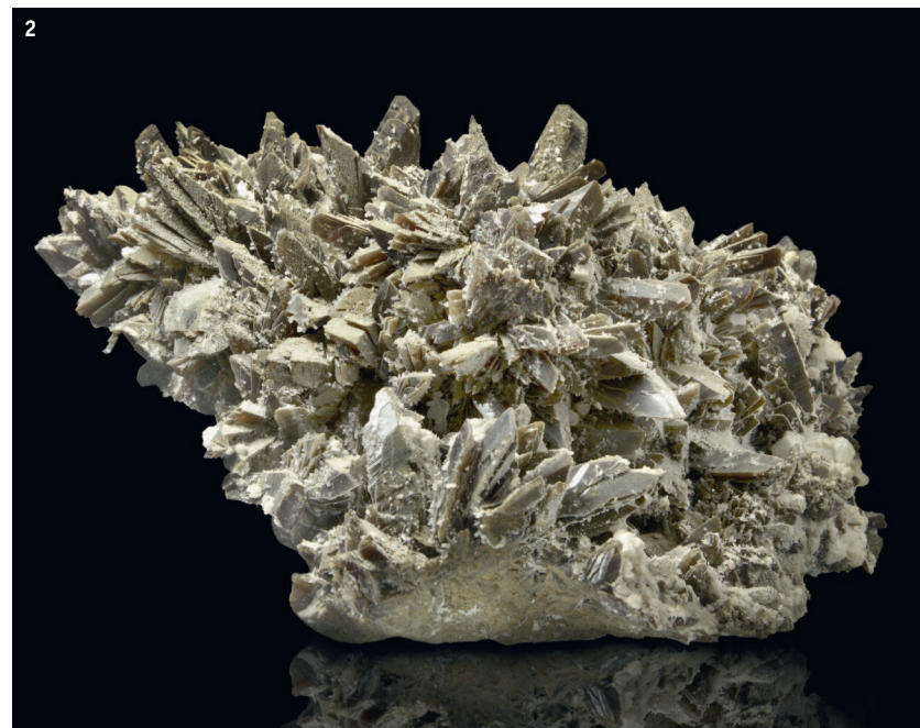
2. Axinite . 20 x 16 cm. Bor quarry, Dalnegorsk, Primorye, Russian Far East.