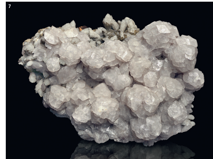
7. Calcite . 58 x 42 cm. Dalnegorsk, Primorye, Russian Far East.