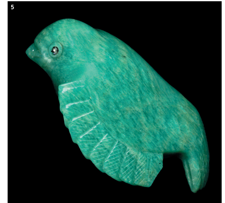
5. A pecking sparrow (amazonite, diamonds). 3.3 x 3.5 x 0.6 cm. C. Fabergé company, Russia, late 19 th – early 20 th century. PM1243.