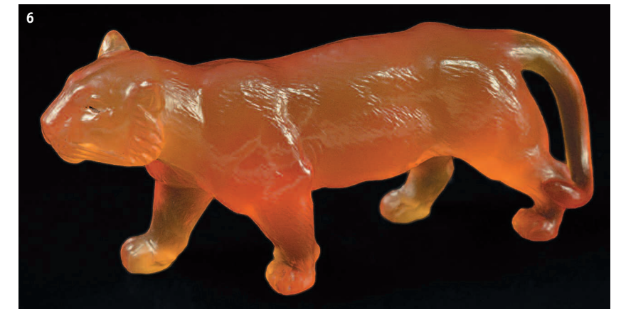
6. A tiger (carnelian). 5.1 x 2.8 x 2.3 cm. Russia, late 19 th – early 20 th century. PM1316.