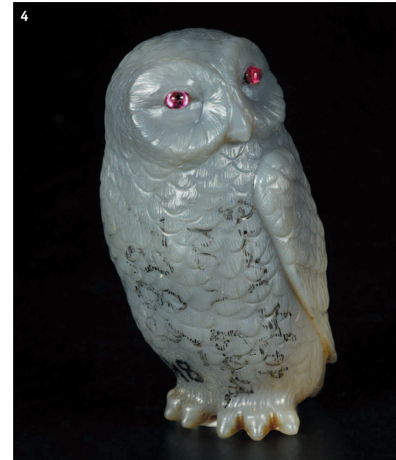
4. An owl (chalcedony, ruby). 2.5 x 2.6 x 5.2 cm. C. Fabergé company (?), Russia, early 20 th century. PM1348.