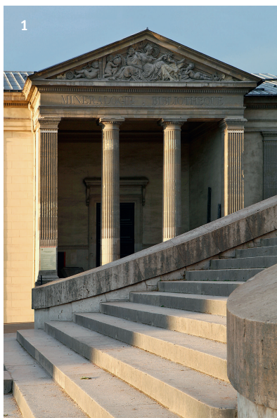
1. Mineralogy and Geology Gallery Main Entrance of the National Museum of Natural History, Jardin des Plantes, Paris, France.

Muséum National d’Histoire Naturelle, Paris, France