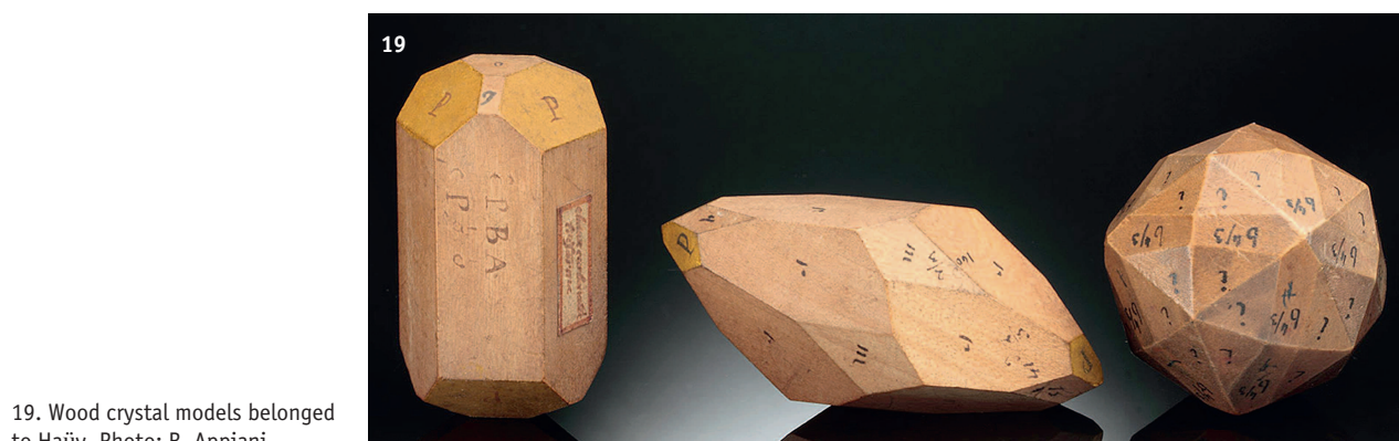
19. Wood crystal models belonged to Haüy.