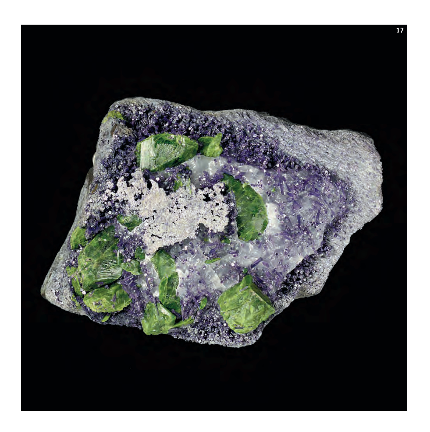
17. Cr-titanite crystals with Cr-amesite crystals on chromite . 16 x 13 cm. Saranovskoye deposit, Perm krai. Specimen: A.V. Donskov.