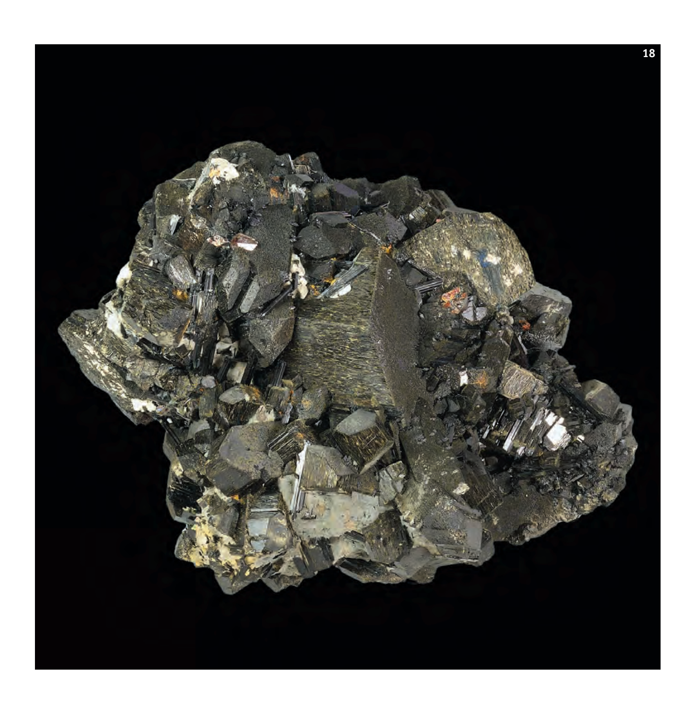
18. Oriented intergrowths of aegirine and alkaline amphibole crystals. 18 x 11 cm. Vishnevye Gory, South Urals. Specimen: A.V. Donskov.