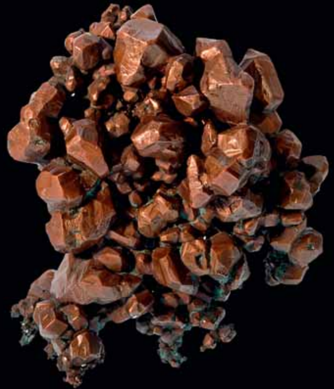
Copper. Lake Superior Dist., Houghton Co., Michigan, USA. 13.4 cm wide. Copper. Lake Superior Dist., Houghton Co., Michigan, USA. 12.7 cm tall. Copper (spinel twins). Ray Mine, Mineral Creek Dist., Pinal Co., Arizona, USA. 19 cm tall. (in the middle of the page)