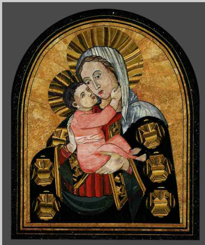
The icon "Our Lady of Tenderness". 42 x 52 cm.

The artists see their mission in filling their creations with modern content while preserving unique traditional technique. Their leverage is a skillful use of broad spectrum of semiprecious and gemstones which give the artists a possibility to create splendid colorful compositions. Their works do not yield in comparison with pic-