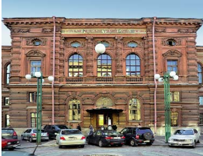
Building of the Saint-Petersburg State Artistic-Industrial Academy after A.L. Shtiglits, where “World of Stones” Shows take place regularly