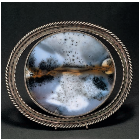
Broche made of landscape chalcedony by Felix Ibragimov